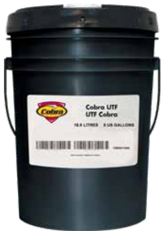
COBRA UTF FBB0008440 18.9L