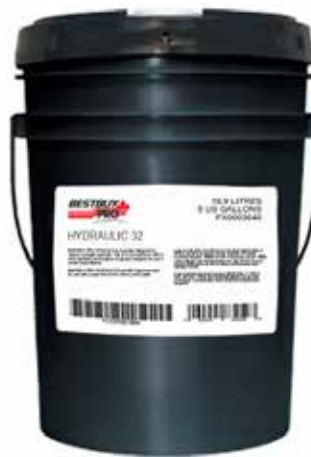
BESTBUY PRO HYDRAULIC 18.9L