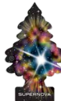
Rose Thorn U1P-17308