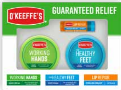
O'KEEFFE'S GIFT PACK 100919