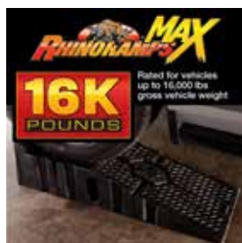
RhinoRamps MAX Vehicle Ramp - Pair 11912MI