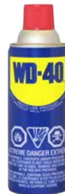
WD-40® Multi-Use 311g 01111