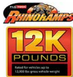
RhinoRamps Vehicle Ramp - Pair 11909MI