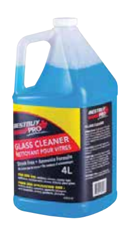
Glass Cleaner 28416 -4L