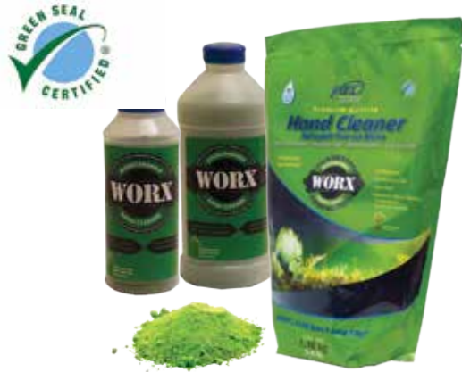
WORX® Biodegradable Hand Cleaner #11-1650-12 #11-1104 #11-2300