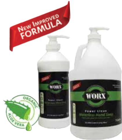
WORX® Power Clean Hand Soap #36-0432 #36-0401