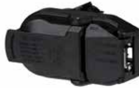
OEM Replacement Dual-Out- put 7 & 4-Way Connector (Plugs into Any US CAR)